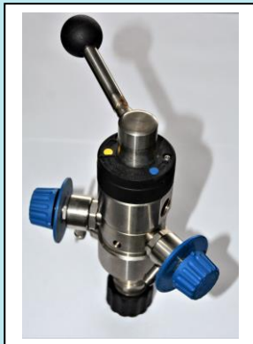
CRIE 1-27 N-CA-A-E-HQQE